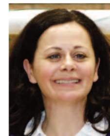
Geraldine Hughes, Actor/Writer/Producer