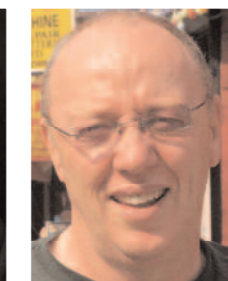
Terry George, Director