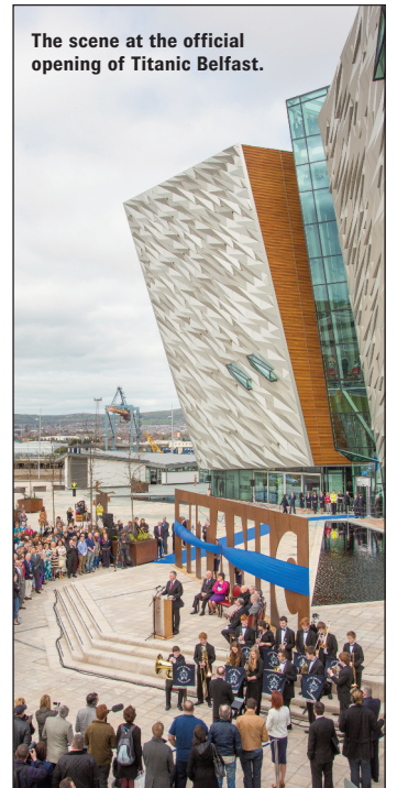
The scene at the official opening of Titanic Belfast.

first phase of Titanic Quarter's Financial Services Centre.