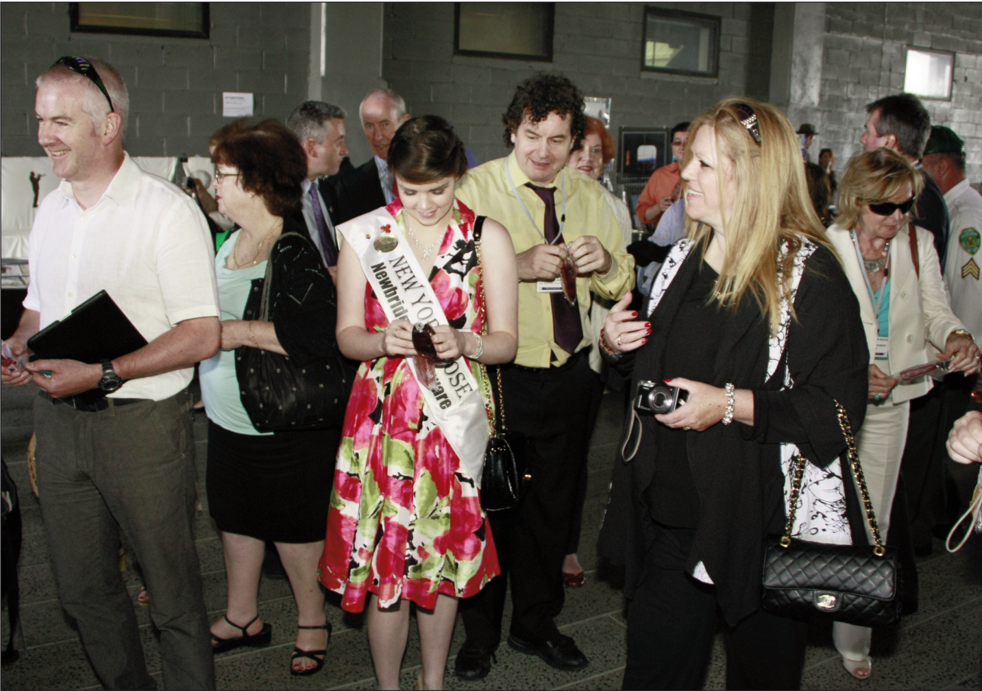
Conference attendees who were taken on a tour of Manhattan's Highline park.