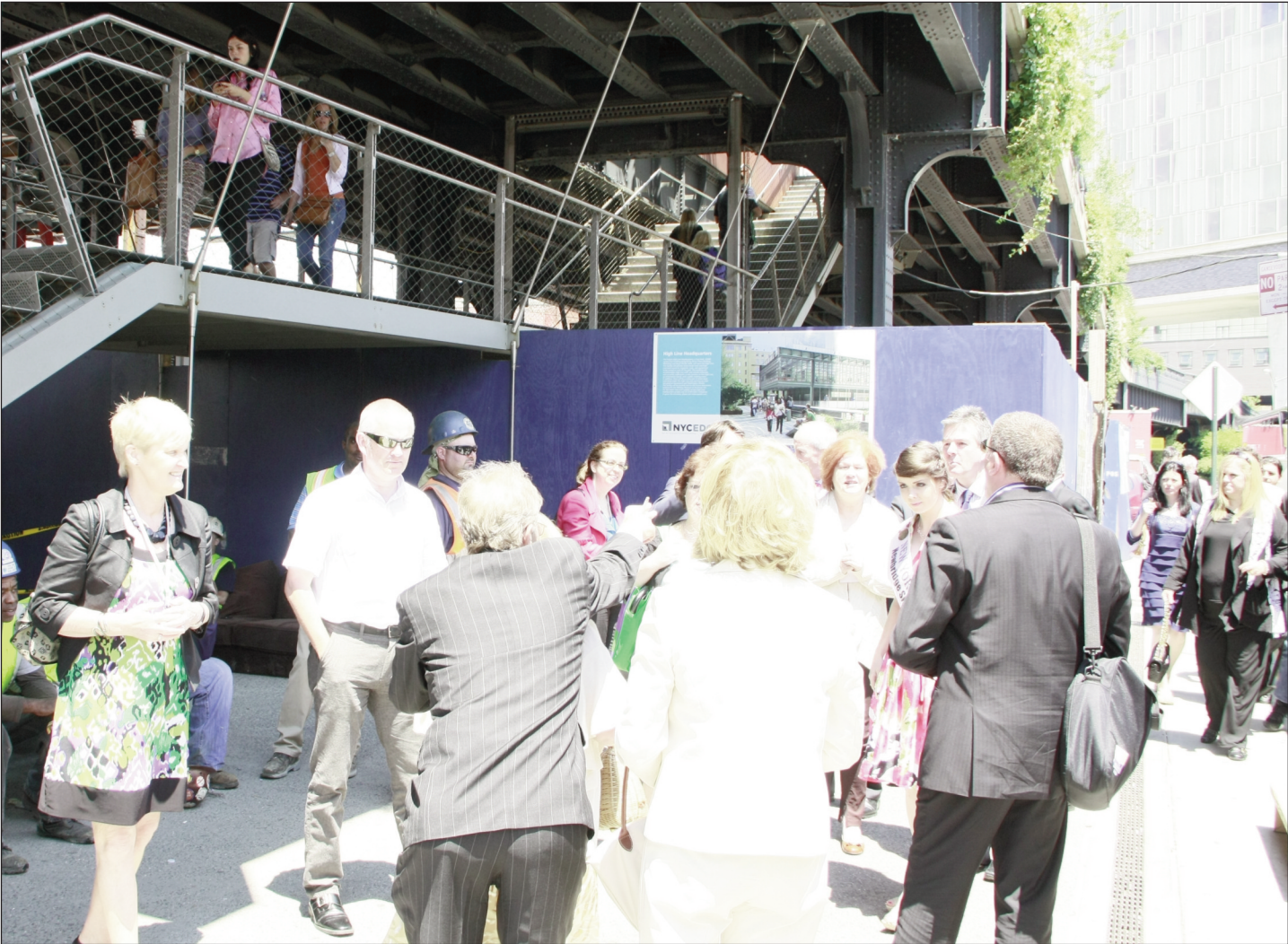
Conference participants set out for the highline tour.