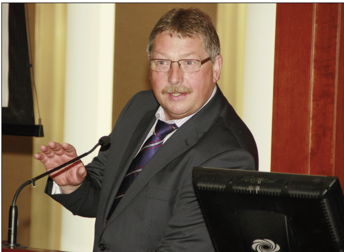
Minister Sammy Wilson speaking at the conference.

Following up on the observation that there is said to be $1.7 trillion held in cash in the U.S. owing to a crisis in investor confidence, Minister Wilson, said, "It's estimated that U.K. firms are sitting on £700 billion in cash. Something has to be done with it, or shareholders will say, 'We want some.'"