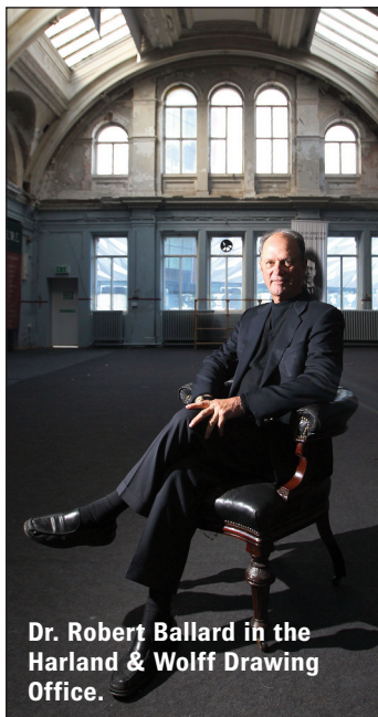
Dr. Robert Ballard in the Harland & Wolff Drawing Office.